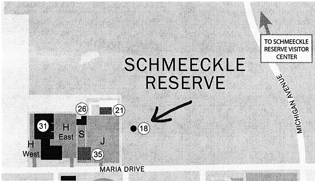
Figure 2. Map of Schmeckle showing the meeting location at Schmeckle pavilion, labeled number 18.